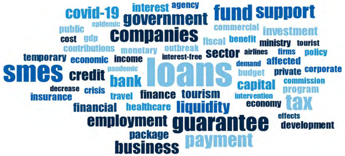
Figure 1: Word Cloud Based on Analysis of Codes

The word cloud, which forms the first stage of the data analysis process, is shown in Figure 1. In Figure 1, the size of the words is shaped according to the frequency of passing in the data, and the word in the center is the word with the largest frequency. In order to narrow down the words used in this study, the value of 50 as a frequency was determined as the lowest value and words with a frequency value above 50 were included in the word cloud. In the second stage, words (conjunctions, preposition, etc.) that are not related to financial policies and subject integrity extracted from the word cloud. According to the word cloud, loan has come to the fore as the most repeated word in financial policies. In fact, the concept of “credit”, which means the same as loans, is very often reflected in the word cloud. In addition, words that are directly related to financial policies such as tax, liquidity, employment, bank and interest are frequently repeated words. Furthermore, words such as SMEs, companies, fund, capital, business, tourism and travel came to the fore in financial policies. Based on this, it can be interpreted that the financial policies implemented by EU countries in relation to the tourism industry in the COVID-19 process are aimed at eliminating the problems of industry, sector or business.